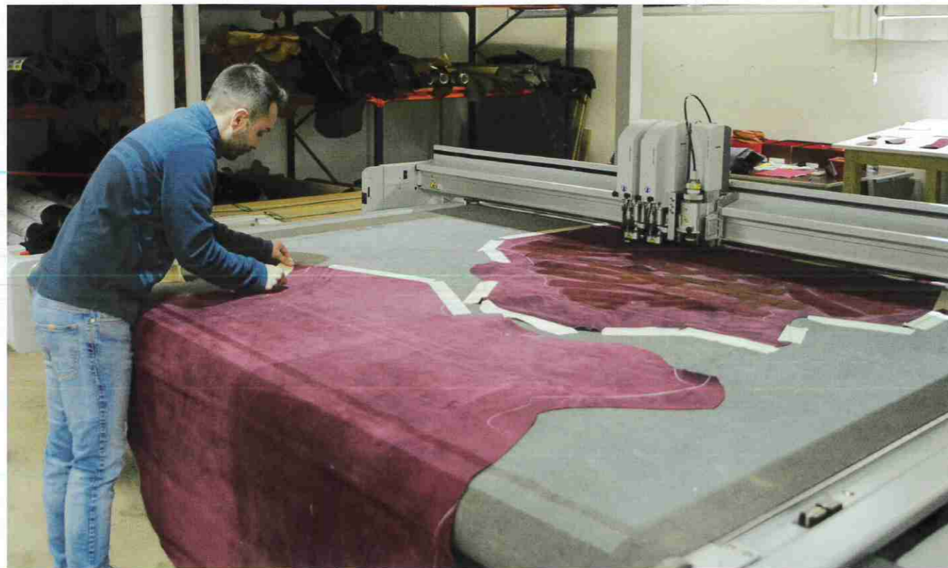
Alta Zapateria combines a respect for traditional craftsmanship with the most modern production equipment available.

Despite the strong focus on traditional craftsmanship, Alta Zapateria is open to employing modern production equipment. With the investment in a Zünd G3 cutter with projection system, digital leather cutting became an integral part of the company's production workflow. For Albadalejo and his team, a primary goal of the cutter acquisition was to preserve Alta